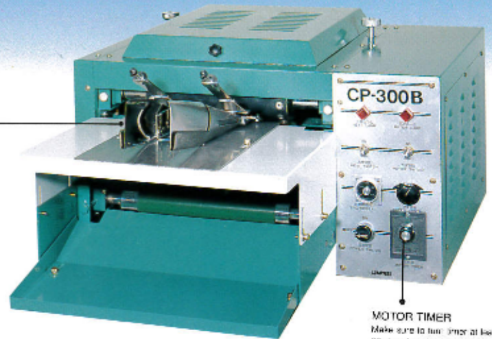
MOTOR TIMER Make sure to turn timer at least 33-min after shut off to cool down the belt.